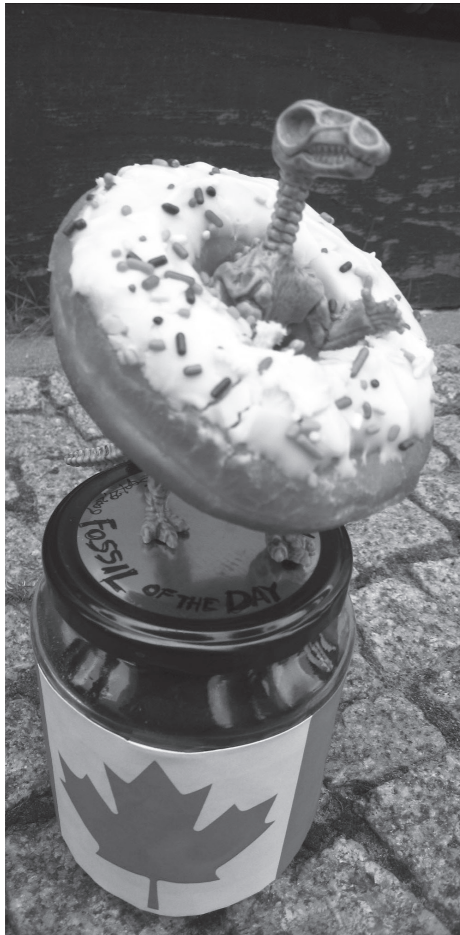
A Sugar-Coated Dinosaur arrived at the doors of the Canadian Embassy, yesterday... Go to: http://tinyurl.com/yaja5qp to savour the moment...

"Yesterday, while Obama spoke to the General Assembly, Harper was in Oakville, touring a Tim Horton's "innovation centre" and touting his government's tax policies. And on Tuesday, when Obama and others addressed a conference on climate change, Harper had a grip-and-grin with New York Mayor Michael Bloomberg." -"Obama shines, Harper absent", Toronto Star