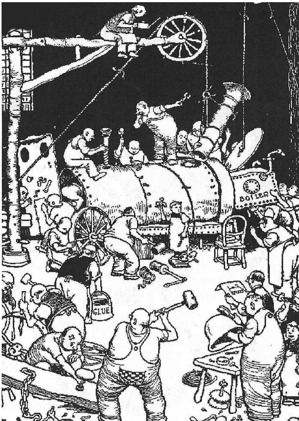
NAMA construction team at work

Good governance and broad environmental integrity in REDD are crucial to the long-term success of sustainably reducing forest emissions, and are thus more than covered by the mandate of the UNFCCC. ECO leaves Parties with the fun task of elaborating how these elements can be effectively anchored and implemented in REDD. Go get 'em!